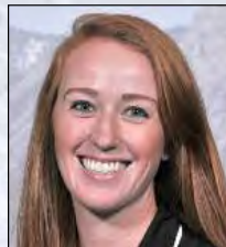
M.T. Eisner Strength & Conditioning