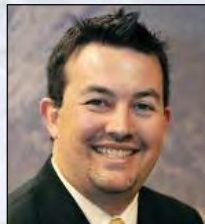
Curtis Snyder Sports Information